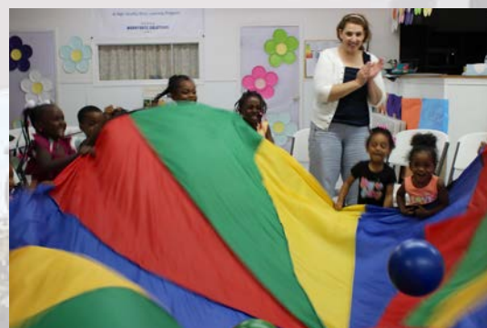
Parent’s Night Out - May 2025

This quarter at Genesis CDC, our children explored the foundational truth of Genesis 1:1 – “ In the beginning, God created... ” through engaging Bible lessons about God’s power and creativity. Faith came to life as our class joined in a heartfelt prayer of thanksgiving after one of their classmates survived being struck by a vehicle—an unforgettable reminder of God’s protection and grace. We celebrated culture and freedom during our vibrant Juneteenth event, practiced emergency preparedness through fire, lockdown, and severe weather drills, and created space for families to rest and recharge during our Parent’s Night Out , hosted in partnership with generous community supporters. Each moment reflected our commitment to spiritual growth, safety, and strong family engagement.